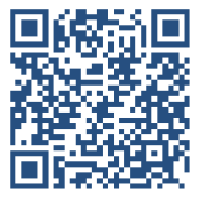
Scan the QR code to make an appointment!

The New Jersey Motor Vehicle Commission’s Mobile MVC Unit is rolling into Glassboro, hosted by the 3rd Legislative District! Stop by the 3rd Legislative District - Gloucester County Office (711 N. Main St. Glassboro, NJ 08028) to tackle tasks like Real ID, registration renewals, and more on March 3, 2025, through March 7, 2025, from 9:00 AM to 2:45 PM.