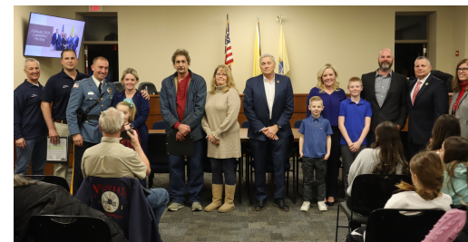
Mantua Township's Deck the House winners!