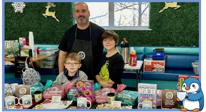
The Blended Joe Coffee & Cookie Bar Holiday Pop-Up on November 25th, 2023, was a success!