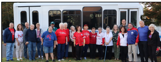
Mantua Township's New Senior Bus

We are also thrilled to announce that we recently received our new senior bus. With the assistance of the County's "Capital Transit Investment Plan," we received a $50,000.00 grant from Gloucester County that went toward the purchase of our new bus, which in turn, saves local tax dollars. The new bus is already paying dividends as our seniors take advantage of the free transportation services.