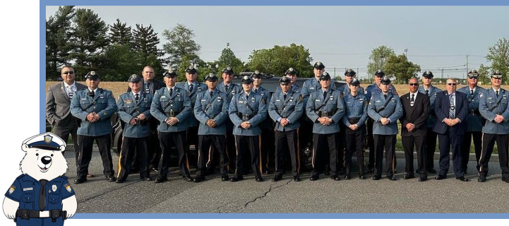
The Police Officers of Mantua Township that help keep our community a safe place.

PRSRT STD U.S. Postage PAID Deptford, NJ PERMIT #41