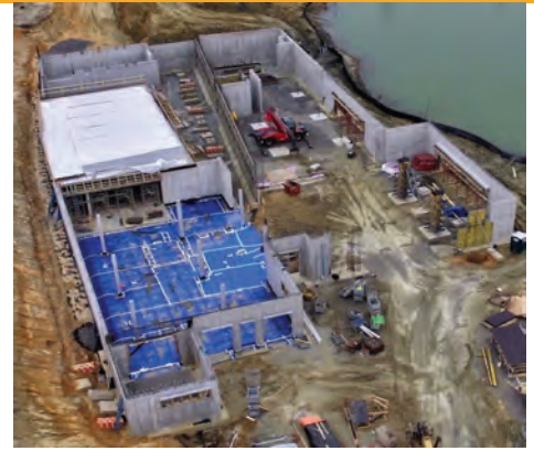
Above: Drone shot of ground floor progress courtesy of Lou Iacona. Below: Rendering of museum coming in 2023.

Inspired by the core themes of preservation, exploration, and education, the Jean and Ric Edelman Fossil Park and Museum of Rowan University is a one-of-a-kind active fossil dig site that offers visitors the unique opportunity for hands-on discovery at a remarkable site of scientific wonder. This Mantua Township based world-class tourist destination contains thousands of fossils and provides a view into life in the Cretaceous Period 66 million years ago. Once a shallow ocean environment, then used for mining for over a century, the site is now a 4-acre quarry, encompassed by a 65-acre property, where "citizen scientists" can dig for fossils, alongside paleontologists. The museum boasts 3 main exhibits, retail store and café, dino-themed playground, VR Chamber, live animals and more! Visit Rowan.edu/fossils for more information. Coming in 2023.