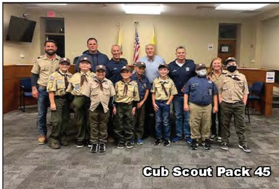
Cub Scout Pack 45