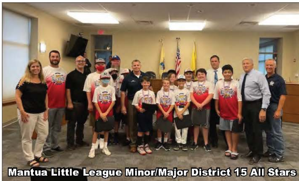
Mantua Little League Minor/Major District 15 All Stars