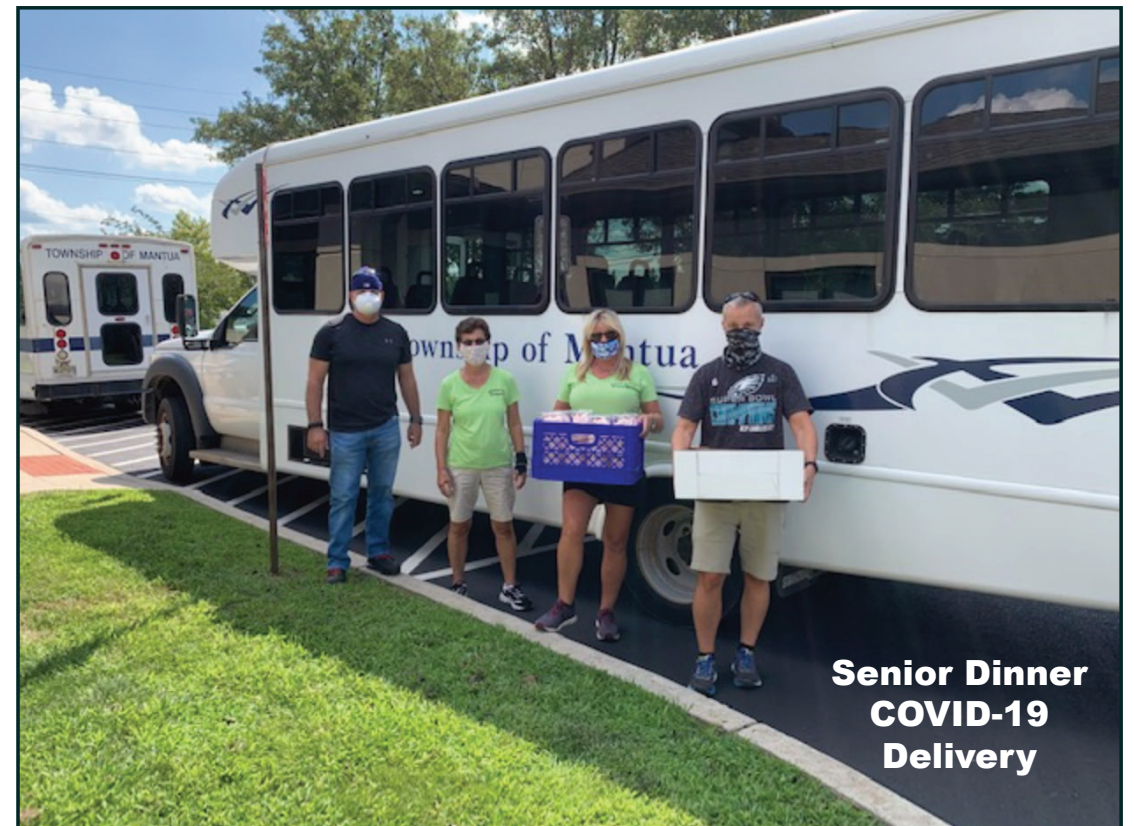
Senior Dinner COVID-19 Delivery

This State program provides financial assistance and help to low income eligible households that are having difficulty paying their heating & cooling bills. For more information call 856-468-1500 x113.