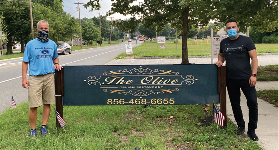
New Italian Restaurant - The Olive 195 Center Street