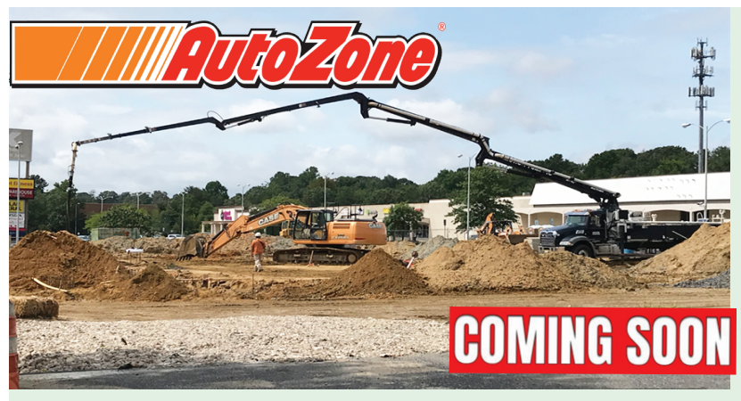
222 Bridgeton Pike

More Tollhouse Plaza Upgrades Coming in Fall 2020!