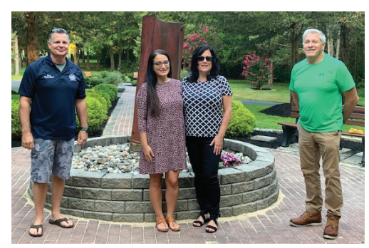
Patriot Day 2020 at Chestnut Branch Park 9/11 Memorial