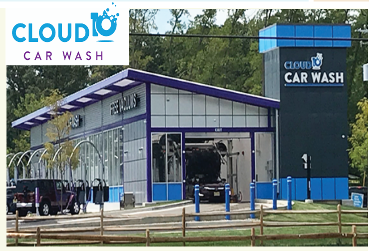
510 Woodbury-Glassboro Road